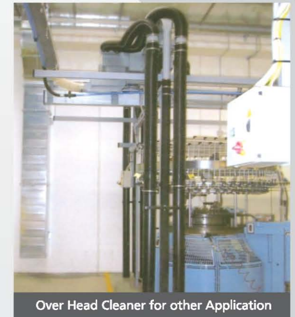
Over Head Cleaner for other Application