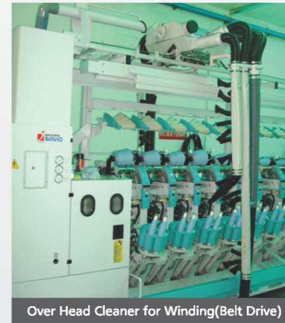
Over Head Cleaner for Winding(Belt Drive)