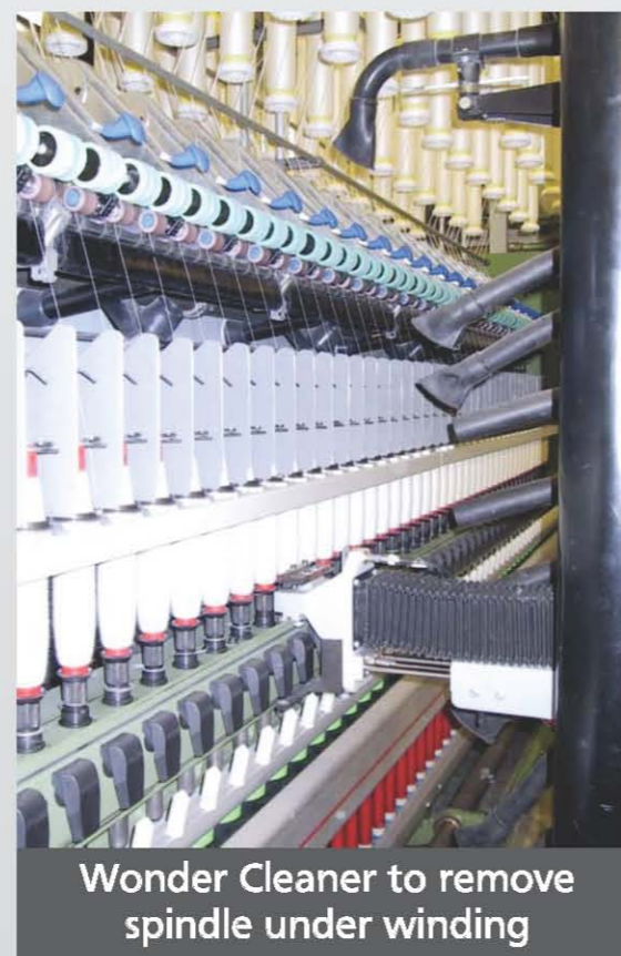
Wonder Cleaner to remove spindle under winding