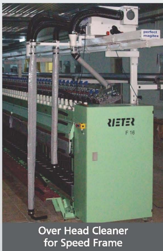
Over Head Cleaner for Speed Frame